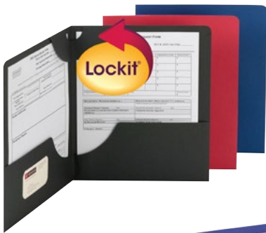
Lockit® Two-Pocket Folders