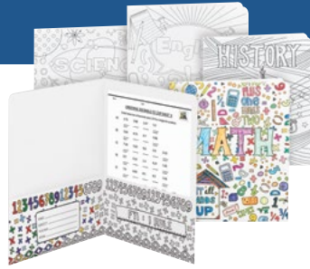
Coloring Two-Pocket Folders