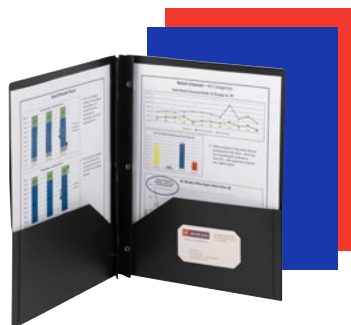
Poly Two-Pocket Folders with Fasteners