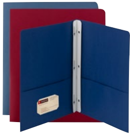
Two-Pocket Folders with Fasteners