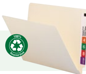
100% Recycled End Tab Folder with Reinforced Tab