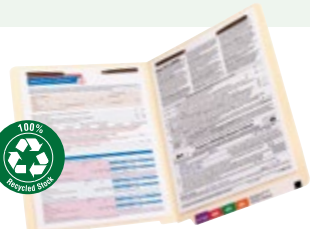
100% Recycled End Tab Fastener Folders with Reinforced Tab