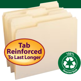
100% Recycled File Folders with Reinforced Tab