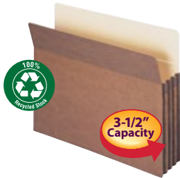
100% Recycled File Pockets