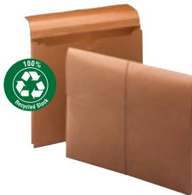
100% Recycled Redrope Wallets